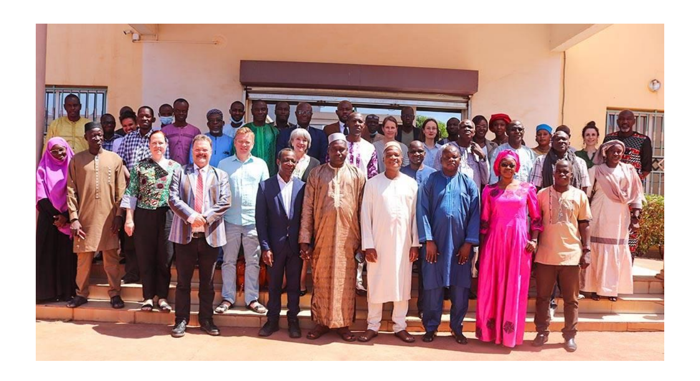
Uppsala, June 2024