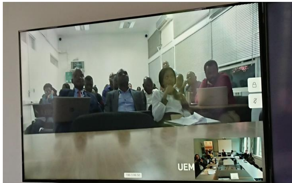
The first UU/UEM Virtual Seminar was launched on 25 February 2019.